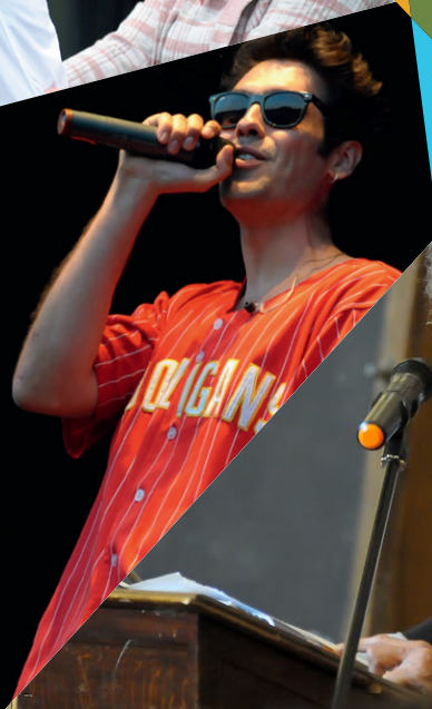
John Agard, Poet